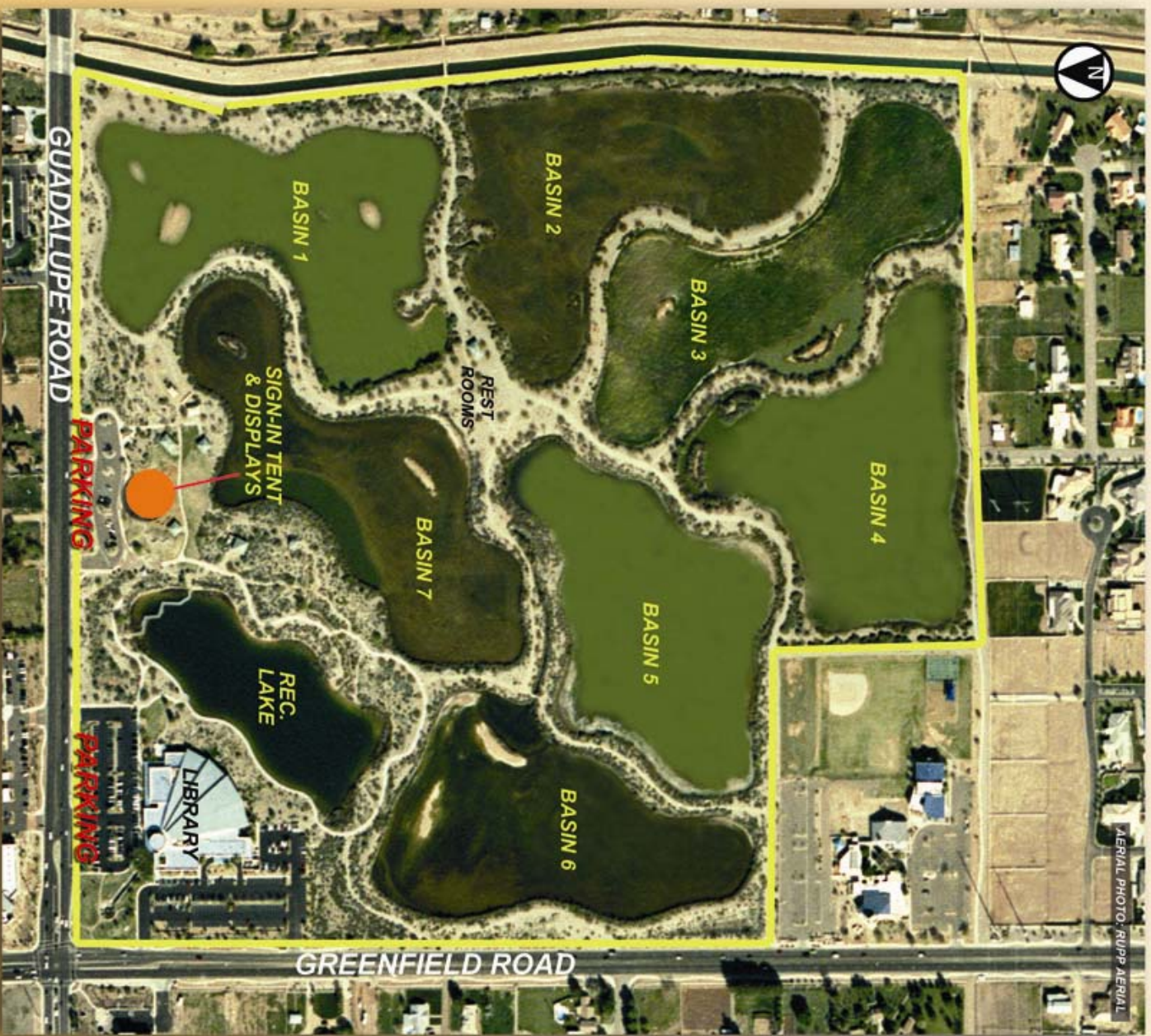
PHOTO OF GILBERT WATER RANCH